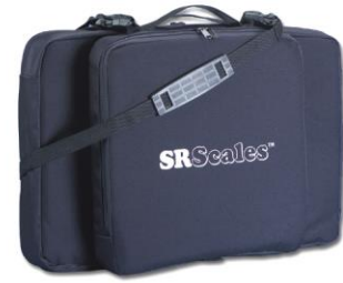
Figure 1: Optional Soft-Sided Carry Case

The SR241KG Portable Infant/Adult Scale is a unique portable scale system that offers the versatility of being able to weigh infants, toddlers, and adults on one lightweight and weather resistant system. Weighing in itself at a mere three kilograms, this scale is specialized for use in pediatrician or physicians' offices and is also perfect for traveling nurse applications. The optional Soft-Sided Carry Case (Figure 1) protects the scale and facilitates its portability.