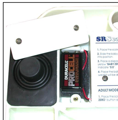
Figure 3: SR241KG/SR241SOKG Battery Compartment